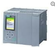
CPU S7-1516TF-3 PN/DP