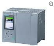
CPU S7-1516T-3 PN/DP

With a width of 175 mm, the dimensions of the CPU 1516T-3 PN/DP and CPU 1516TF-3 PN/DP are identical to the dimensions of the CPU 1517T-3 PN/DP and CPU 1517TF-3 PN/DP.